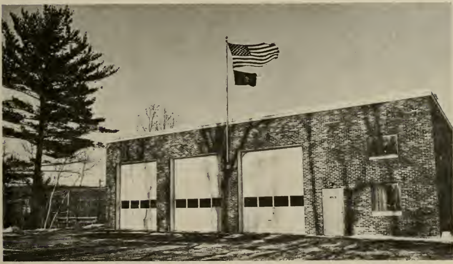
New Municipal Garage