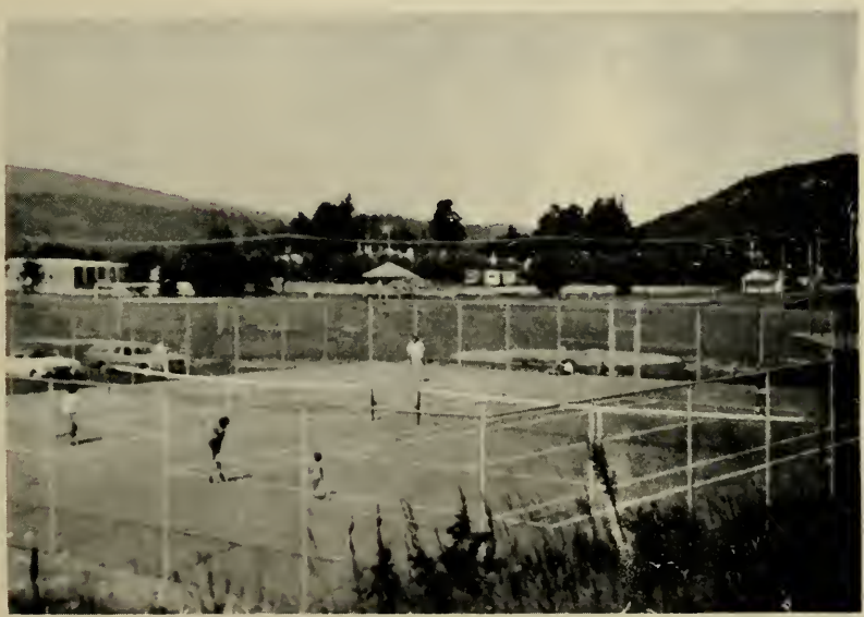
New Town Tennis Courts