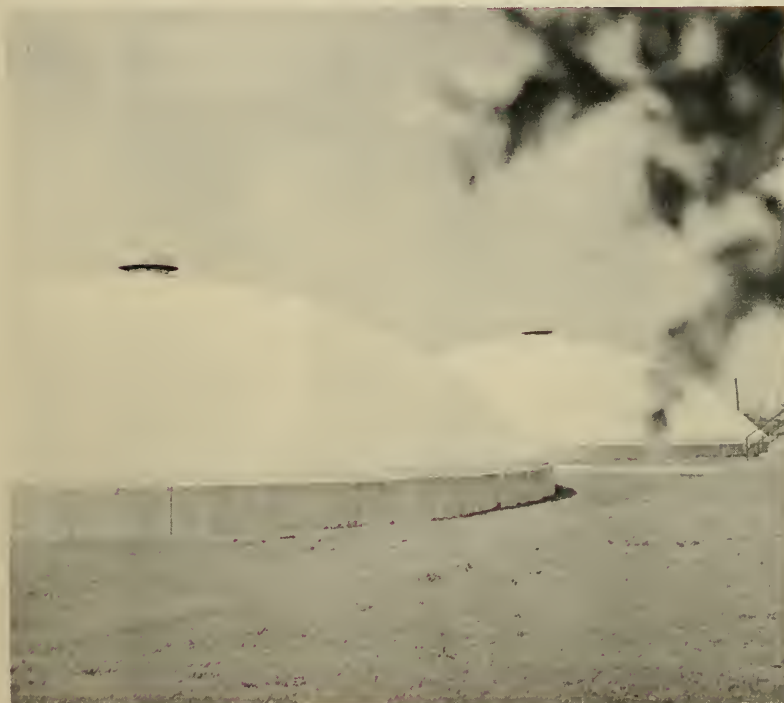
Dow Domes at the Ashland Sanitary Plant