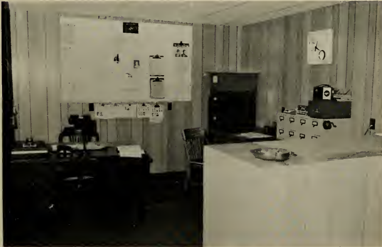
New Office of the Police Department