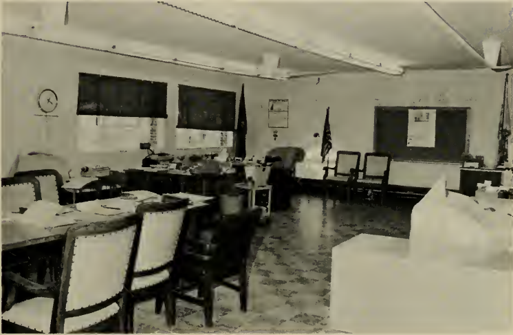
New Town Office