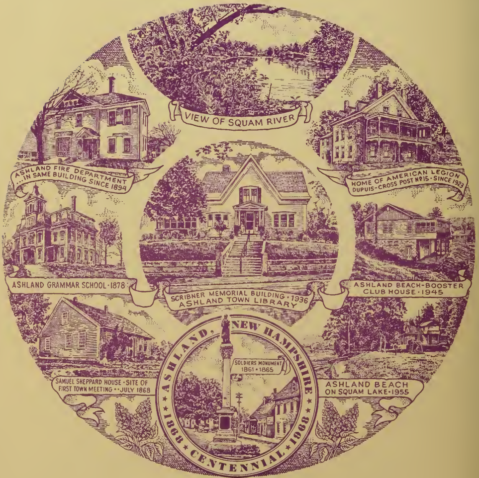
VIEW OF SQUAM RIVER