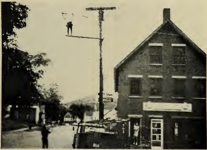
The Old Way