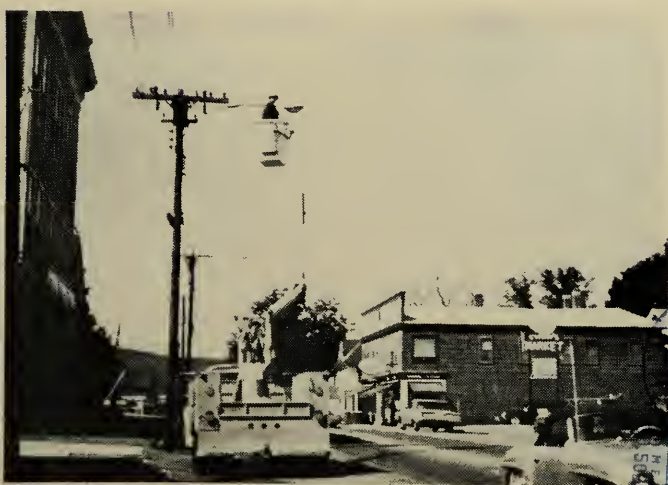
The New Way