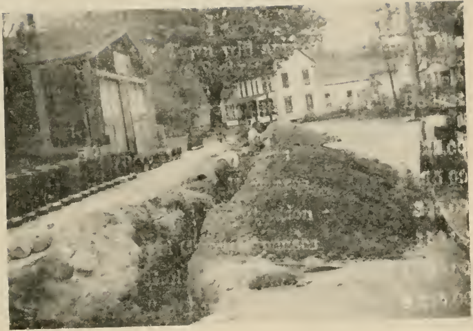
SCHOOL STREET CONSTRUCTION