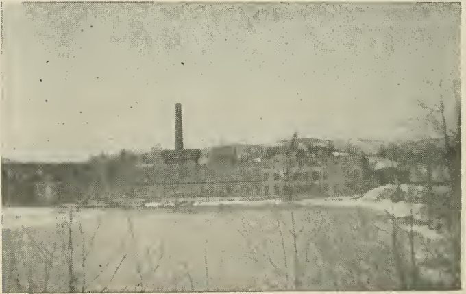
ASHLAND PAPER MILLS