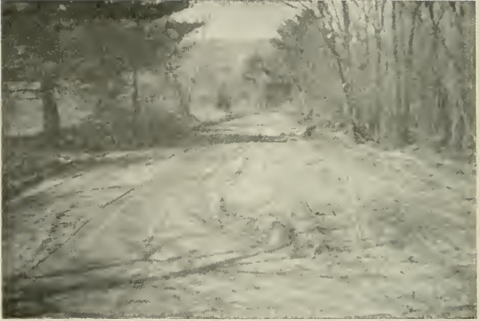
ROAD TO DUMP — WIDENED