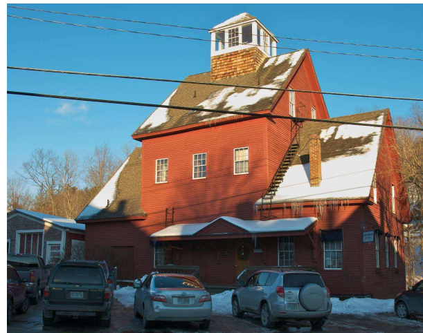
Ashland Grist Mill