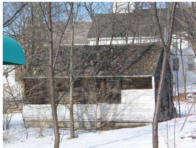
Rueben Whitten House

The White Mountain Country Club has had some modifications, including a new chimney, vinyl siding, replacement windows and doors, and the removal of solar panels from the roof. The Rueben Whitten House is still awaiting restoration.