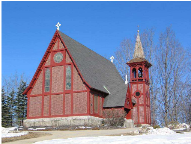
St. Mark's Church

The exterior of the Town Hall has seen little change since 1982; the most important alteration being the construction of a new entrance for the Police Station on the north side of the building, which was completed in 1997. Thanks to a federal and state grant supplemented by local fundraising, the Railroad Station was restored and renovated in 1997-98. The exterior was restored to its original appearance with the re-creation of a door, a window, and part of the trackside platform, which had all been removed. Since 1999, the building has served as a railroad history museum operated by the Ashland Historical Society.