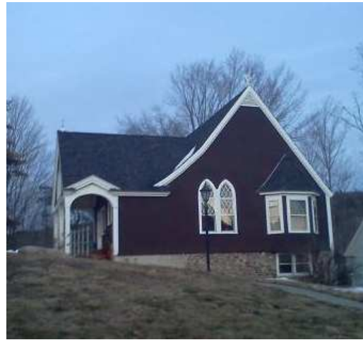
St. Mark's Parish House

St. Mark's Church had its chimney replaced in 1995 and its tower rebuilt and restored to its original appearance in 1998-99. The 2005 renovations of the parish house included handicapped access and a new entrance porch.