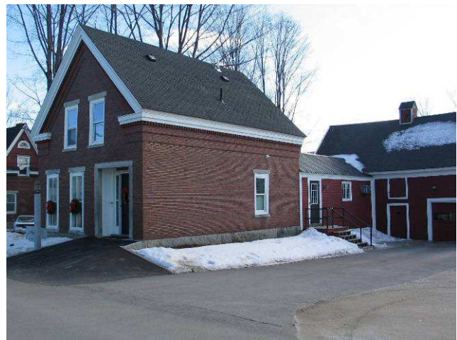
Harold C. Proulx House (Dupre)

The Common Man Restaurant has had additions on the west side to enlarge the dining room and on east side to enlarge the kitchen. A fire escape was added on the east side, and the entrance has been moved from the street front to the west side facing the new patio. The Proulx House (Dupre) has seen only minor changes, such as replacing the front steps with a ramp. The front steps have been replaced by an asphalt ramp, the porch converted to work spaces with new siding and windows, and many windows have been replaced.