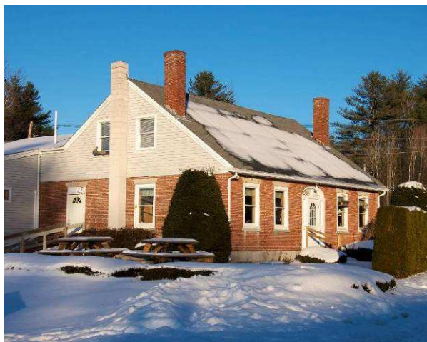
White Mountain Country Club