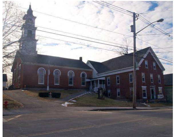
First Free Will Baptist Church

The old school was acquired from the Ashland School District by Tri-County Community Action Program (TCCAP) in 2008. It was restored and renovated in 2009-10, maintaining many of its essential architectural qualities. Exterior changes included new windows and front steps, the remodeling of the side entrances, and the addition of a rear entrance with porch. The school now houses TCCAP offices, meeting rooms, and a Headstart classroom. The Baptist Church proper has seen little exterior change beyond the 1993 installation of a wheelchair ramp. The vestry saw the replacement of windows in 1993 and the addition of a