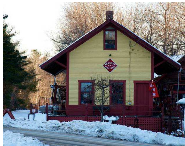
Artist Express Depot

The Scribner Mill is now used for storage and most of the windows are boarded up and the tower entrance has been bricked in. The porch on the eastern side of the Artist Express Depot has been enlarged with new decks on three sides and a sliding glass door added to the northwest side of the building.