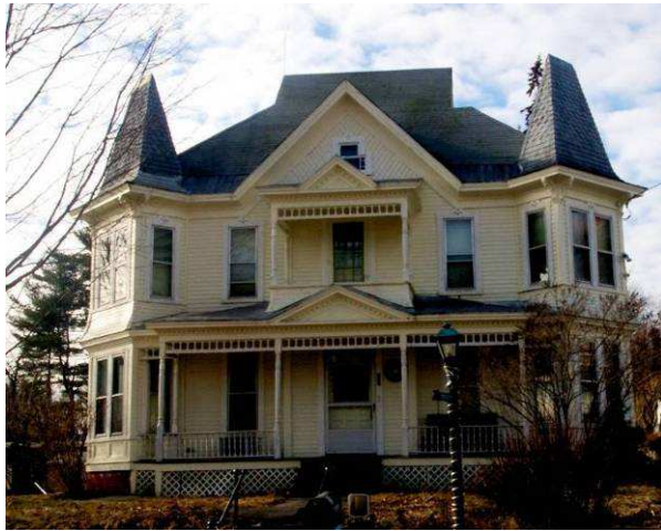
Kroeger House (Marcroft)