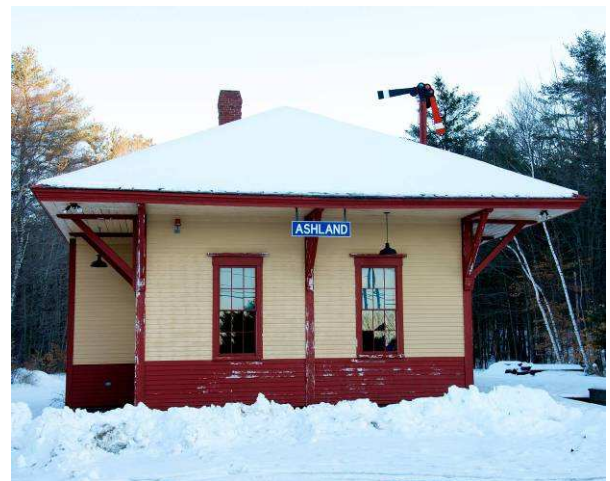
Ashland Railroad Station