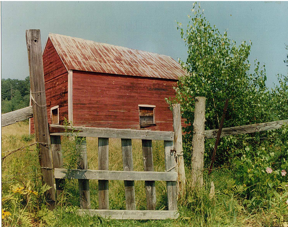
Little Squam Lake, Ashland, NH